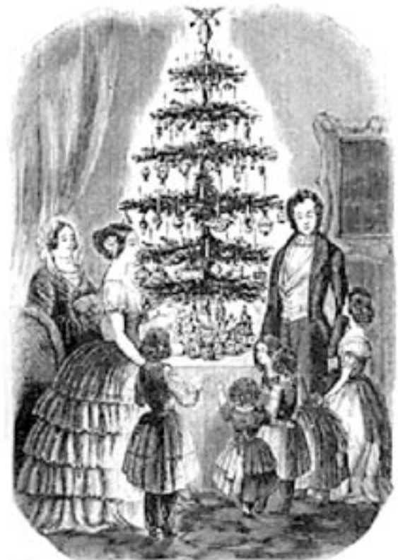
Queen Victoria and Prince Albert decorate their Christmas tree with the royal family in this illustration from the December 1860 issue of Godey's Lady's Book , a popular magazine for women.

Dickens also did a great deal to separate Christmas from its religious context, so that families from all Christian denominations (and even some from other religious traditions) felt free to celebrate it in the traditional way once again. While A Christmas Carol briefly alludes to Jesus Christ, Dickens was never comfortable with organized religion, and he took pains to ensure that his story was not explicitly religious, but that it would promote what he held to be universal values of kindness and charity. A Christmas Carol helped create a new secular tradition that merged feasting and fun with social charity, and which has inspired both Christians and non-Christians to this day.