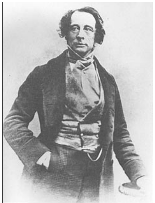
A photograph of Charles Dickens taken in 1850. From the collection of the Huntington Library, San Marino, CA.

In 1865, Dickens was involved in a terrible train derailment that killed 10 people and seriously injured 49 others. Typically, Dickens (whose train car had tipped but not overturned) went to the aid of the injured passengers until rescuers arrived, then clambered back into his own carriage to retrieve his half-finished manuscript for Our Mutual Friend . While he had seemed relatively unscathed at the time, his health was never good following the accident, and in June of 1870 he suffered a stroke and died at home. He was laid to rest in the Poets' Corner of Westminster Abbey, in a tomb that reads: "He was a sympathizer to the poor, the suffering, and the oppressed; and by his death, one of England's greatest writers is lost to the world."