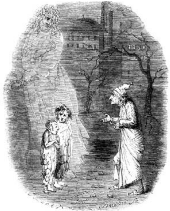
Scrooge confronts Ignorance and Want, an illustration by John Leech from the first edition of A Christmas Carol , 1843.