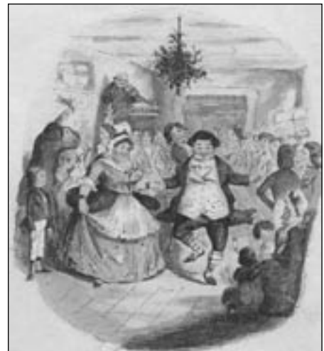
Mr. Fezziwig's Ball, an illustration by John Leech from the first edition of A Christmas Carol , 1843.

Modern-day readers in England and the United States may take it for granted that nuclear families would gather for a special meal on Christmas, but this tradition is almost entirely attributable to A Christmas Carol , which essentially became a handbook for reworking the old rural Christmas traditions for a modern urban lifestyle. It sparked a "Christmas renaissance" that led directly to our contemporary traditions of exchanging gifts and Christmas cards, giving a Christmas bonus to employees, elaborately decorating the home and, most of all, roasting a "prize turkey." It is even possible to argue that Dickens is the single individual most responsible for the fact that Christmas is celebrated today as a secular holiday by so many families outside the Christian tradition.