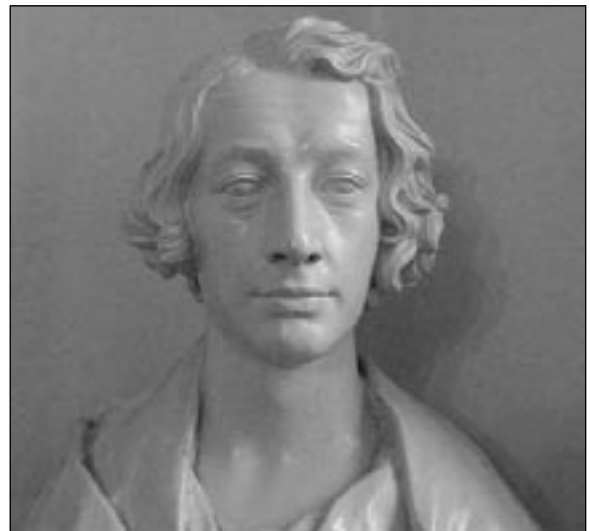
A bust of Charles Dickens was made from life by sculptor Henry Dexter during Dickens’s 1842 trip to America, not long before he wrote A Christmas Carol . According to his wife and friends, it was extremely life-like. This cast of the lost original is in the collection of the Dickens Museum in London.