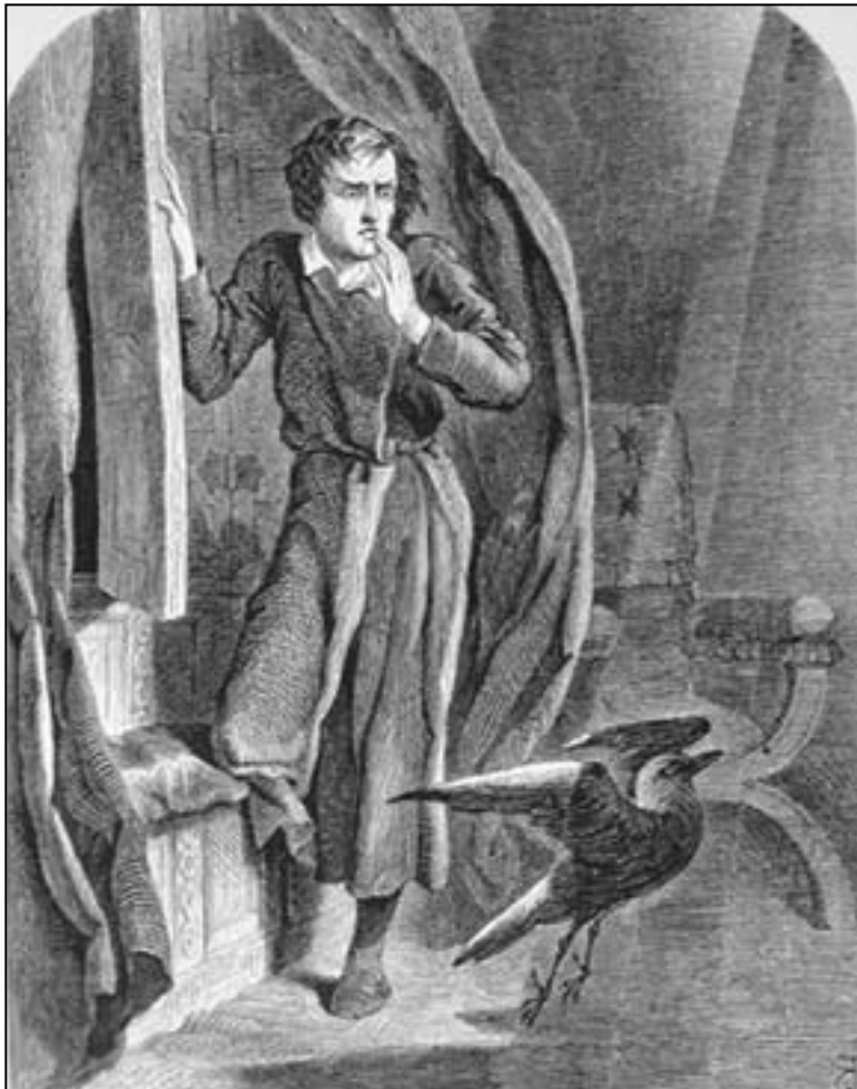
Illustration of “The Raven” by John Tenniel, 1858.