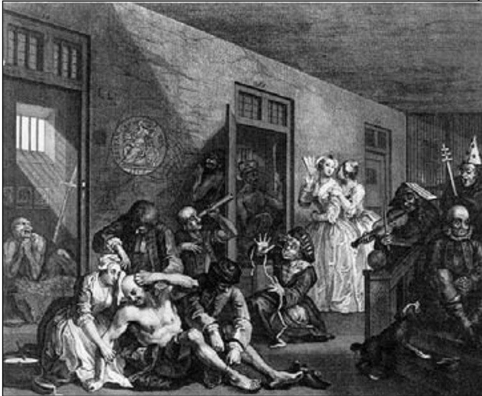
This 1735 engraving by William Hogarth depicts the questionable standards for mental health “care” in Poe’s era. It depicts Bedlam Hospital, London’s most famous (or infamous) lunatic asylum.

While medical science was advancing rapidly in the United States during Poe's lifetime, mental disorders remained essentially unexplored and taboo territory. Only a few decades before, early American colonists allocated the blame for unusual or erratic behavior to witchcraft and other supernatural causes. Those who were affected by demons or were suspected of practicing witchcraft were, at best, sent into prisons or almshouses for the rest of their lives. If mental illness affected a wealthy family, efforts were usually made to cover this up by keeping the person in seclusion at home.