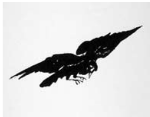
Illustration of "The Raven" by Edouard Manet, 1889.

Poe confronts the Demons one final time before his impending death.