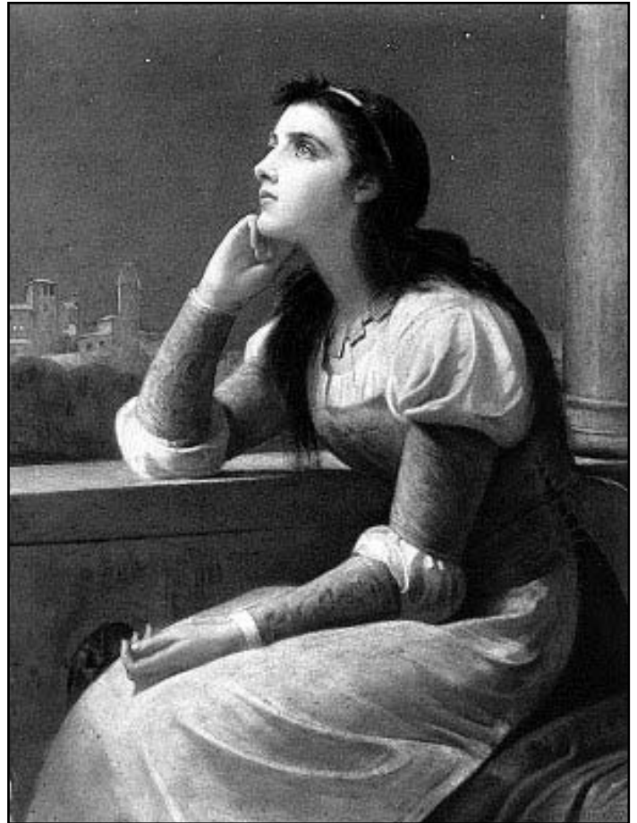
Lithograph print of Juliet by Philip H. Calderon (1888) originally produced for the London weekly newspaper Graphic . From the collection of the Folger Shakespeare Library, Washington, DC.