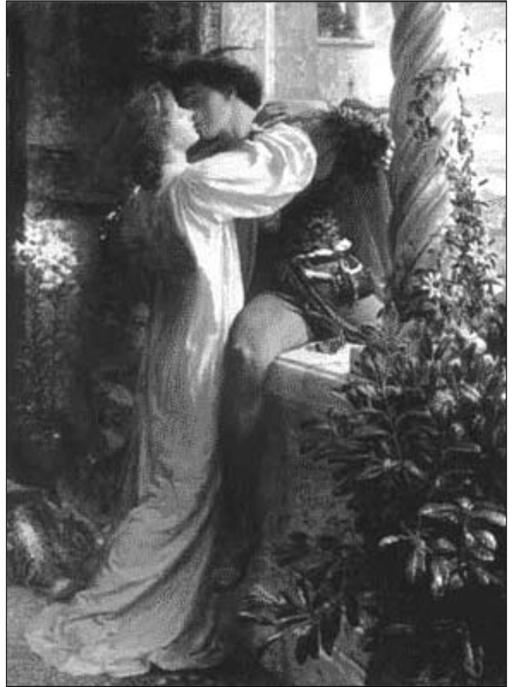
"One kiss, and I'll descend." (III.v.42) Painting of Romeo and Juliet by Sir Frank Dicksee (1884). Original in the collection of Southampton City Art Gallery, Southampton, England.

Over 30 modern operatic versions of Romeo and Juliet have been produced, the most famous musical adaptation being Leonard Bernstein's West Side Story . Other modern adaptations of the ever-popular classic love story have included ballets and television productions.