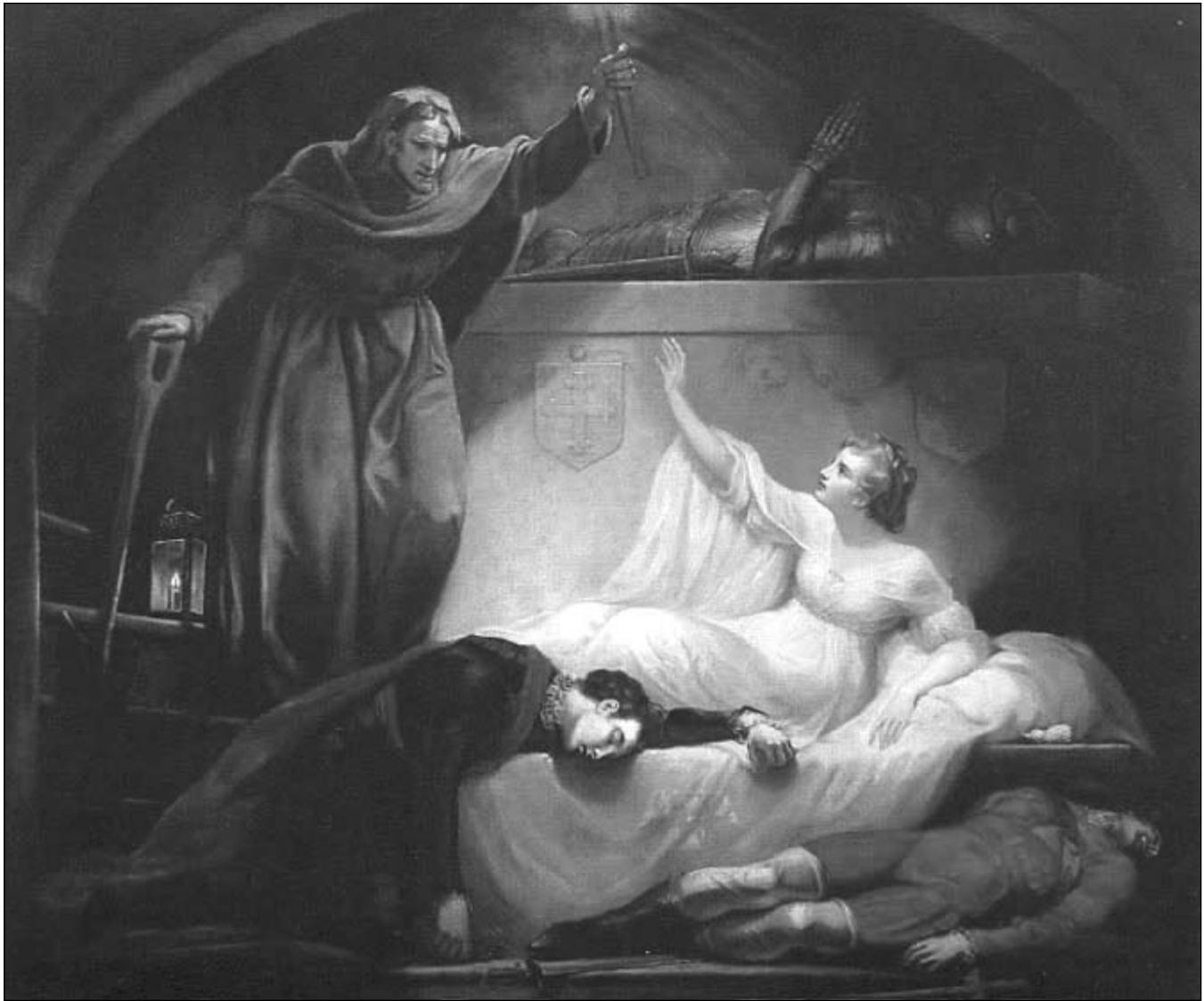
“O comfortable friar! Where is my lord?” (V.iii.148) Painting by James Northcote (1789), reprinted in Boydell’s Shakespeare Gallery .