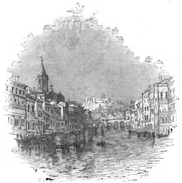
Woodcut of Verona, Italy in The Illustrated Shakespeare , 1847.

Paris too goes to the churchyard to mourn for Juliet, but hides when he hears Romeo and Balthasar approaching. After Balthasar departs some distance away on Romeo's instructions, Paris emerges and challenges Romeo. They fight, and Paris is killed. Romeo enters the Capulet tomb and, seeing Juliet's "dead" body, still as beautiful as she was in life, kills himself with the poison. The friar enters, too late to save him, just as Juliet awakes. Friar Laurence attempts to remove Juliet from the tomb, but she refuses to leave Romeo's corpse. Once alone, hearing the night watch approaching, she kills herself with Romeo's dagger. The Prince and the parents of both households enter. They discover the truth of their children's demise in Romeo's suicide note, which he left with Balthasar. Filled with grief, Montague and Capulet finally make their peace with one another.