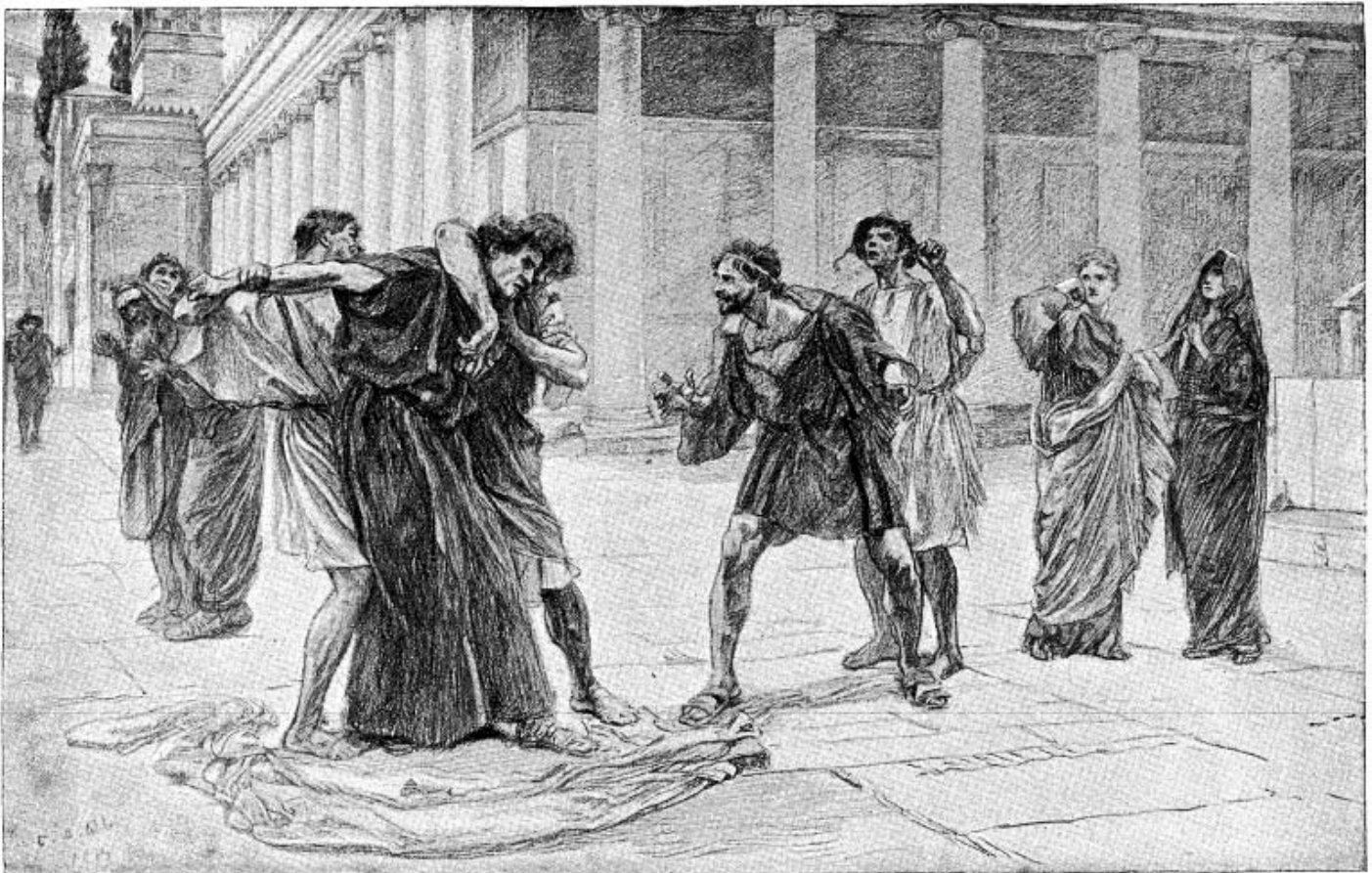
ADRIANA. "O, bind him, bind him! let him not come near me." Act IV., Scene IV.

Reprinted with permission from the Utah Shakespearean Festival study guide to The Comedy of Errors , 2003.