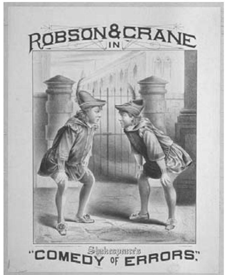
Promotional poster for the 1878 national tour of The Comedy of Errors , starring Stuart Robson and W.H. Crane, the most popular comic duo of American theatre in the late 19th century, as the Dromios.