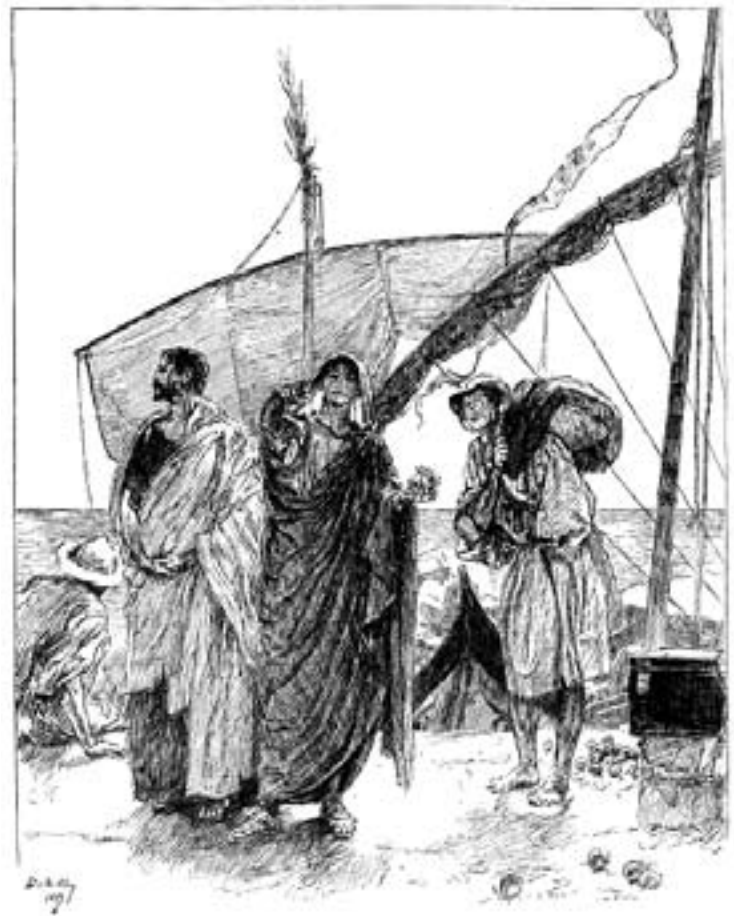
ANTIPHOLUS OF SYRACUSE. "Go, bear it to the Centaur." Act I, Scene II.

Its broad, farcical nature has made the play well-suited to whimsical and creative production decisions. In 1938, Fyodor Komisarjevsky directed it for the Royal Shakespeare Company in a "hallucinogenic," surrealist style that seemed drawn from Alice in Wonderland. In the same year, Lorenz and Hart turned it into the first-ever Broadway musical adaptation of a Shakespeare play, The Boys from Syracuse , which married classical Greek costumes and contemporary swing music. More recently, the Mansaku Company explored its similarities to the classical Japanese farce style known as Kyogen in a 2001 performance at Shakespeare's Globe entitled The Kyogen of Errors , entirely in Japanese with English supertitles.