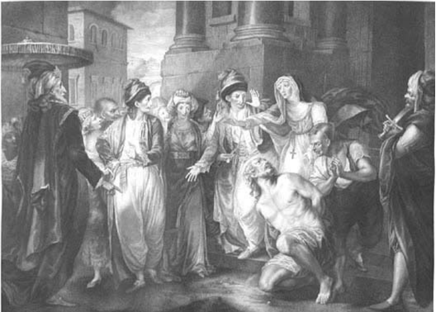
The Abbess reveals herself as Aemilia in this 1794 engraving by Charles Gauthier Playter, from Boydell's Shakespeare Gallery .