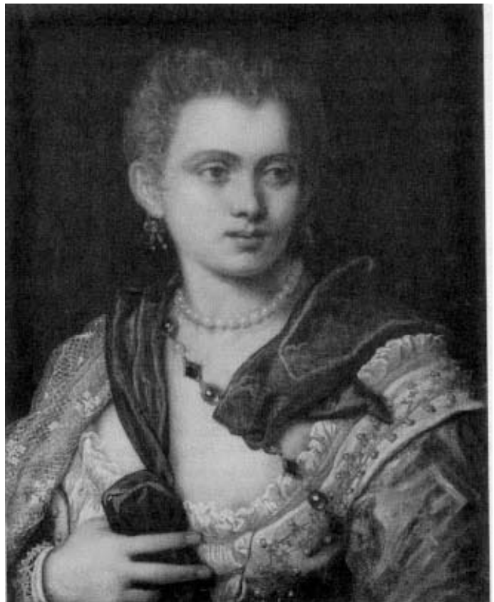
Portrait of Veronica Franco (attributed to Jacopo Tintoretto) painted around 1575, when Franco was 29. In her life, Franco was Venice’s most celebrated courtesan as well as an accomplished poet and a social reformer who administered a government-financed home for indigent women.

Given her diamond ring, Antipholus’ description of her, and how easily she enters into conversation (and even an alliance) with Adriana and Luciana, it is likely that the Courtesan in The Comedy of Errors is meant to belong to this world of high-class “professional mistresses.”