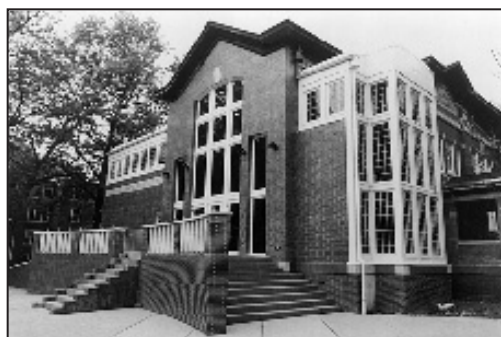
The Shakespeare Theatre of New Jersey's Main Stage