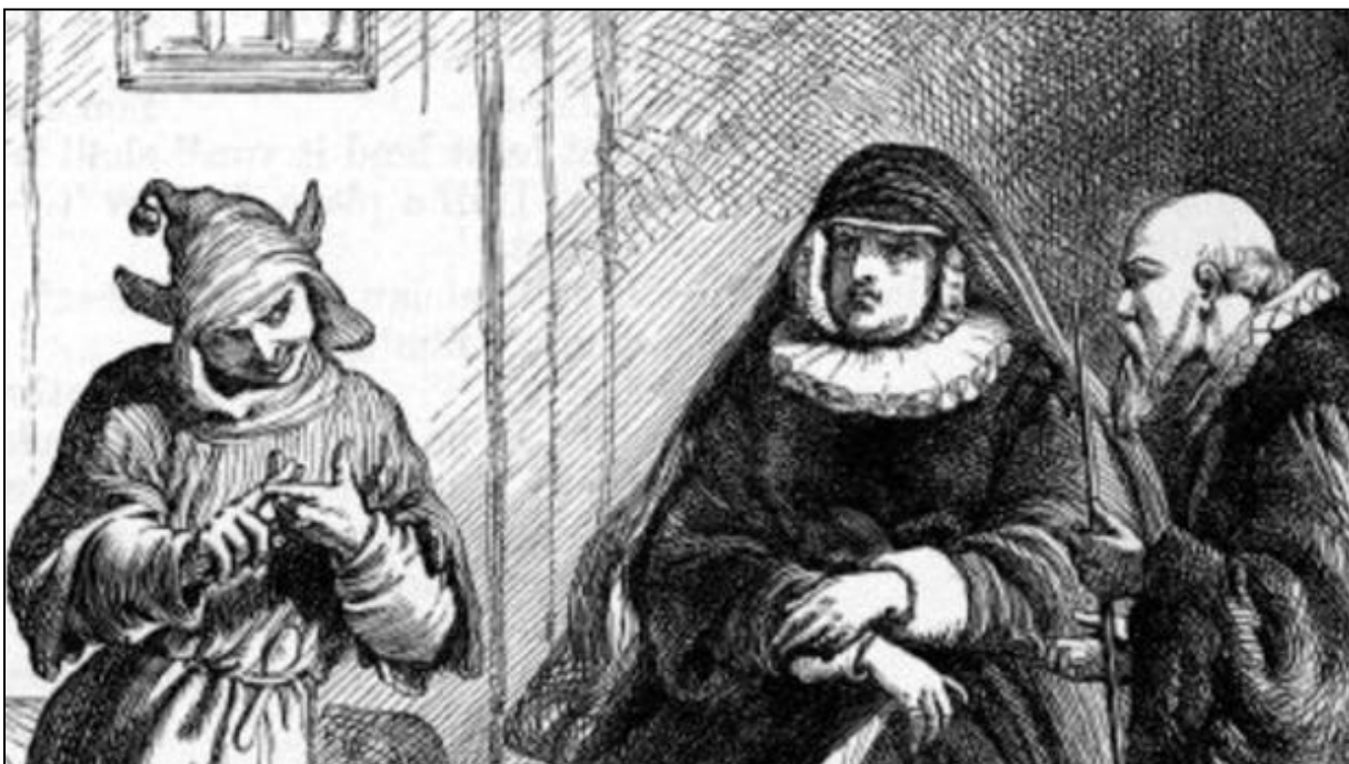
Lavatch the Clown, the Countess, and her steward Reynaldo in an illustration by H.C. Selous taken from Cassell's Illustrated Shakespeare: the Plays of Shakespeare . Ed. Charles & Mary Cowden Clarke. London: Cassell, Petter, & Galpin. Issued in parts 1864-68, then in three vols, 1868.

STANDARD 6: Acquire and use accurately a range of general academic and domain-specific words and phrases sufficient for reading, writing, speaking, and listening at the college and career readiness level; demonstrate independence in gathering vocabulary knowledge when considering a word or phrase important to comprehension or expression.