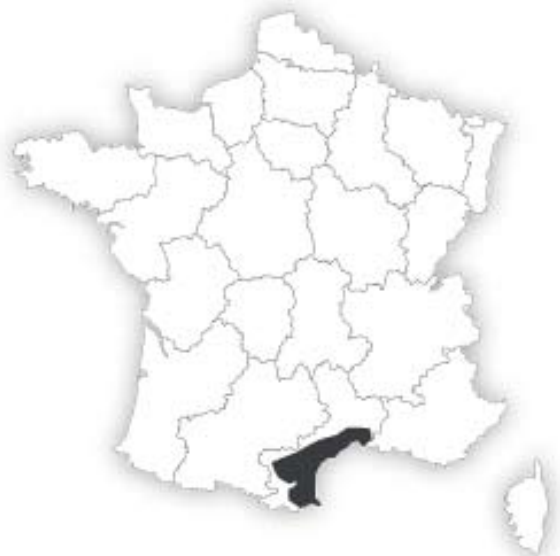
Roussillon (Roussillon-Languedoc) is highlighted on this map of France.