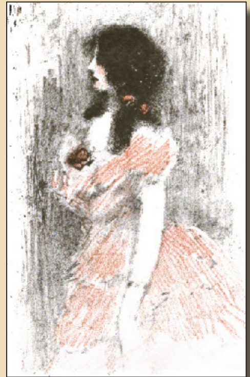
Frontispiece from the script, as published in 1900.

actors, the Telfers; the would-be playwright, Tom Wrench; the unfunny comedian Augustus Colpoys; and the successful Imogen Parrott. Imogen, who has moved on to the prestigious Olympic Theatre, learns that Tom is still struggling as an actor, getting only the smallest and worst parts. He writes plays, but no one is interested in their realistic style. Rose