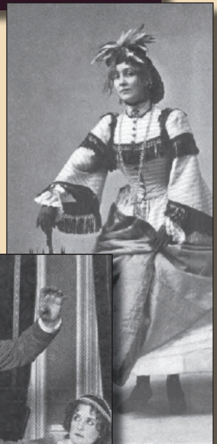
Production stills from the 1898 New York premiere.