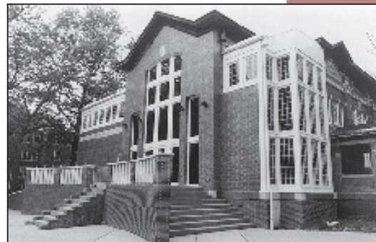
The Shakespeare Theatre of New Jersey's Main Stage, The F.M. Kirby Shakespeare Theatre.