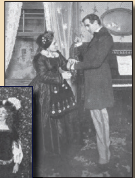
Production stills from the 1898 New York premiere.

1992 - Sarah Brightman and Helena Bonham Carter star in a West End revival of Trelawny .