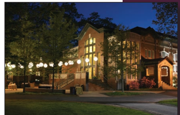
The Shakespeare Theatre of New Jersey's Main Stage