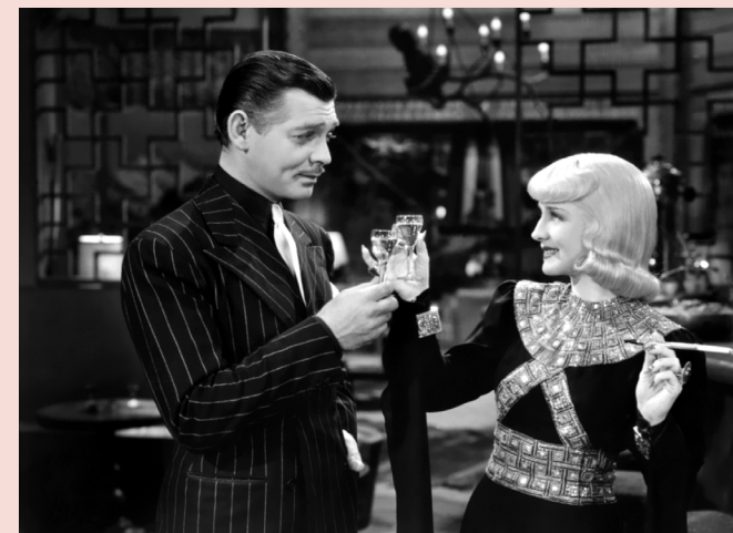
Clark Gable and Norma Shearer in the 1939 film version of Idiot's Delight.

He died of a heart attack in 1955 in New York City, at the age of 60.