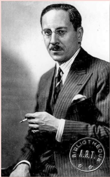
Jacques Deval.

Jacques Deval was a prolific and popular French playwright and author. Born in 1890 in Paris as Jacques Boularan de Cambajoux, Deval was the son of a doctor-turned-actor.