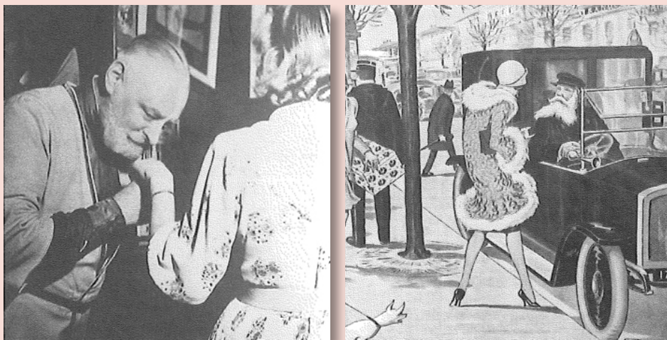
(Left) A Russian count and former colonel in the Tsarist army, working as a doorman at a Paris restaurant in 1938; (right) a 1928 illustration of a Russian taxi driver in Paris.

The characters of Mikail and Tatiana in Tovarich may be fictional, but their plight as impoverished Russian aristocrats was a very familiar one at the time the play was written. Around 1.5 million people fled Russia in the wake of the 1917 revolution, and a high proportion of these émigrés were middle or upper class. As the Bolshevik regime violently stamped out opposition and strove to erase privilege, few in the upper classes could risk remaining in their homeland. They fled in many directions – over 150,000 were evacuated across the Black Sea after the defeat of the White forces, while 250,000 left through Siberia; some were