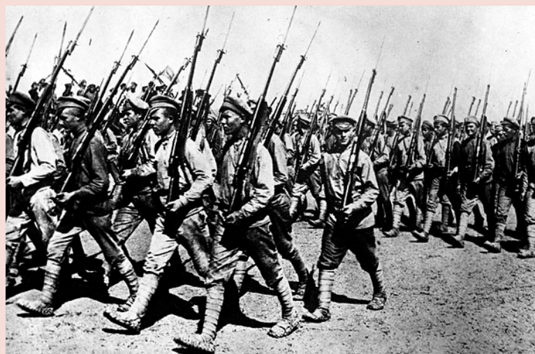
A Red Army unit marching through Kharkov (Source: TIME/Getty).

Three years into WWI, workers began a massive strike that led to the closing of many factories. On February 25, 1917, Tsar Nicholas II invoked the use of military force to end the demonstrations. Instead of attacking the workers, the soldiers and many local police joined them in renouncing the old regime. Nicholas II abdicated his throne, and a provisional government was established. The new government did not fix the situation, however: national debt increased, labor wages decreased, and the food supply grew