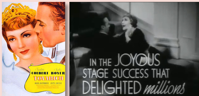
A poster for the 1937 Claudette Colbert film and a screenshot from the movie trailer.

By 1937, Tovarich's popularity had become almost proverbial. Robert Sherwood had playfully written that the only similarity between the European countries after WWI was that "in all of them the munitions plants have been doing capacity business and so has a comedy called Tovarich ." It was a huge fad across the Western world, produced not only on the West End, Broadway, and at regional theatres, but also in amateur and university productions from the 1930s until the early 1950s. Warner Brothers traded on the play's well-known success by releasing a film trailer that showed "audience members" excited