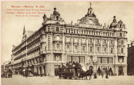
The Lubyanka building in Moscow (Source: Wikimedia Commons).

touché – ‘touched’; in fencing, the acknowledgment of a hit