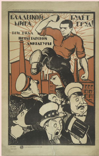
A 1920 Soviet propaganda poster that reads: “Labor Will Rule the World!”.

To ensure his party’s victory, Lenin also employed economic and social restructuring. He imposed “War Communism,” authorizing the government to seize crops from farmers without payment, to forbid formal protesting against the Red party, and to place cities under military rule. Because of the wanton requisitioning of supplies, farmers began reducing production or refusing to plant crops entirely. By 1921, the situation had escalated to a famine. In that year alone a staggering five million people died from famine and related diseases.