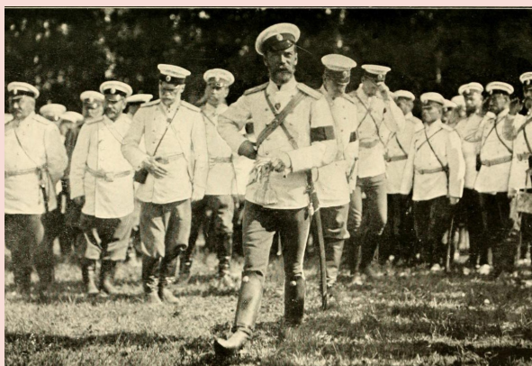
Tsar Nicholas II, whom Prince Ouratieff would have served, with the army.