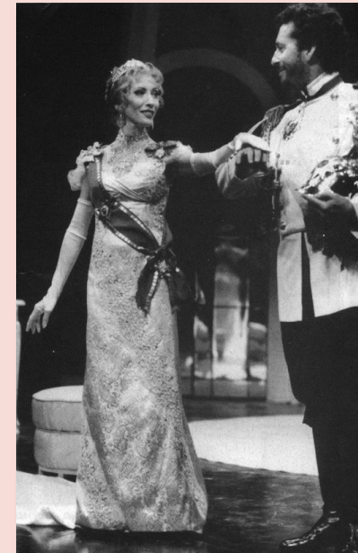
Natalia Makarova and Robert Powell, Chichester Festival, 1991.

Several high-profile off-Broadway runs followed the Broadway run, including a 1937 Los Angeles production with horror film star Béla Lugosi as Gorotchenko. This opening night was the highest grossing in the history of the Biltmore Theatre at the time and was attended by the likes of Cary Grant, Norma Shearer, Marlene Dietrich, and Claudette Colbert. When the manager moved the Russian band from the orchestra pit to a box in order to free up additional seats, the new seats sold out in 20 minutes.