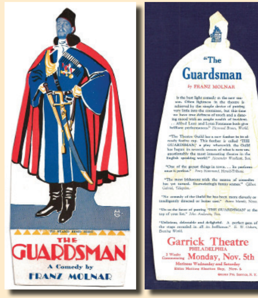
A paper doll used to advertise the Garrick Theatre's production of The Guardsman