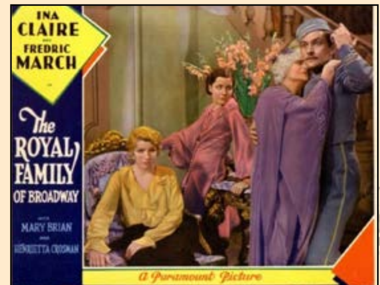
Poster for the film The Royal Family of Broadway

Notable productions since then include the 1975 American Bicentennial Theatre Production, the 1985 Williamstown Theatre Festival revival with Christopher Reeve as Tony Cavendish, and the 2009 Broadway revival. The play has been revived steadily since it first opened in 1927.