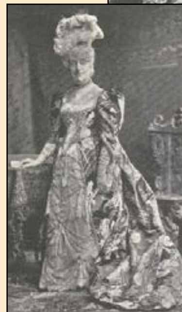
Above: Movie poster for Rasputin and the Empress (1932), the only film in which all three Barrymore siblings appeared together Left: Mrs. John Drew as Mrs. Malaprop — a character she was famous for playing.