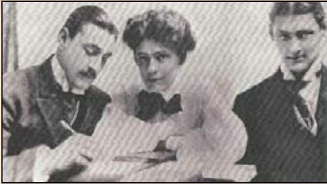
John, Ethel and Lionel Barrymore in 1904

Maurice Barrymore took little interest in his family, so when Georgiana was taken ill with tuberculosis, Ethel Barrymore accompanied her sick mother on a journey to Santa Barbara in the hope that the climate