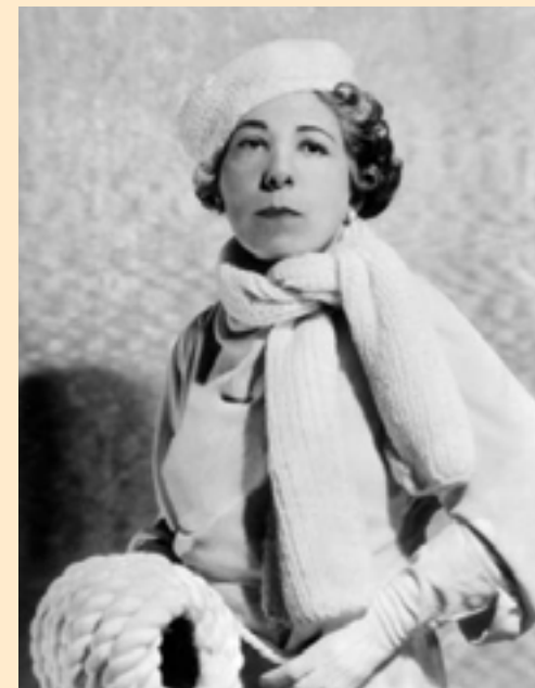
Edna Ferber, 1920

Edna Ferber (1885-1968) was Kaufman's second collaborator and worked with him on some of his most successful plays. She was born in Kalamazoo, Michigan, but moved to Iowa and then Wisconsin with her parents, who operated a general store in each state. Before graduating