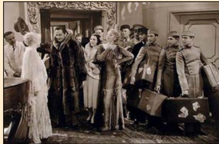
Scene from the film The Royal Family of Broadway