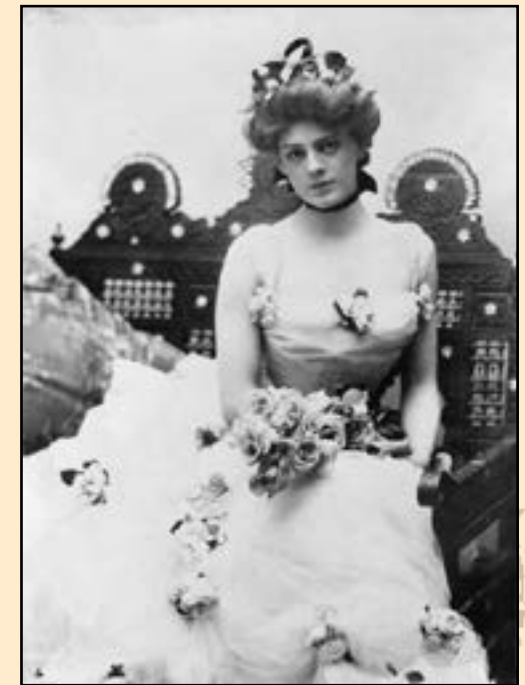
Ethel Barrymore in 1901, wearing a costume from Captain Jinks of the Horse Marines