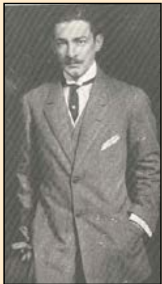
John in 1914

Kaufman and Ferber avidly denied that the Cavendishes were the Barrymores—except perhaps for Tony, whose charm, affinity for the arts, relationship with Hollywood, and reputation for newsworthy behavior was strikingly similar to that of John Barrymore. In fact, Ferber admitted that the Tony character was inspired by John, but said that Tony Cavendish was too improbable to be taken entirely from life, so there was no way that Tony could be completely identical to John. Kaufman said that if the Cavendishes were based on any theatrical family, it would have been an earlier one—the Davenports. Ethel didn't believe Kaufman's defense. She had heard that Kaufman and Ferber had read their play to Ruth Gordon, so she called Ruth to find out if the rumors that the play was a caricature of her family were true. When Ruth said yes, Ethel hung up the phone. She immediately hired the prominent libel lawyer Max Steuer. When news of this broke, the Marx Brothers (who did a famous Barrymore impression) announced in Variety that if the Barrymores sued, they would do the same.