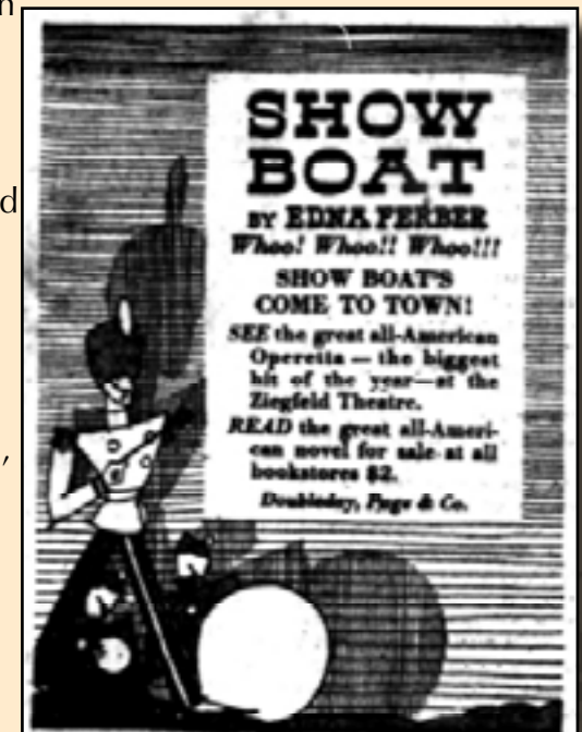
1927 Newspaper advertisement promoting Ferber's novel Show Boat and the stage adaptation

The long hours that Ferber and Kaufman devoted to the play paid off; the script went into rehearsal largely unchanged. The Royal Family opened on Broadway on December 27th, 1927 —one day after the Broadway opening of Show Boat .