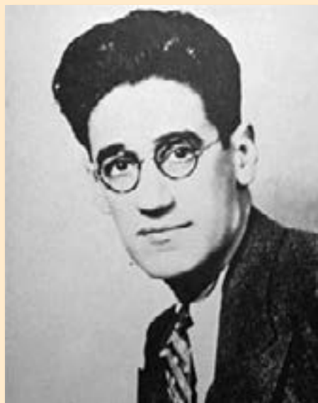
George S. Kaufman, 1915

Between 1921 and 1957, George S. Kaufman (1889-1961) collaborated on 41 plays with 14 different writers, earning himself the title “The Great Collaborator.” Because of his vast output and the number of Broadway hits on which he collaborated, he had an unrivalled status on Broadway during the period between the two World Wars. The drama critic Alexander Woollcott