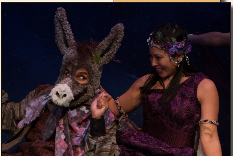
Titania and Bottom in the 2015 touring production of A Midsummer Night's Dream .

The story of Pyramus and Thisbe is found in Ovid's Metamorphoses , and its plot is strikingly similar to that of another Shakespeare play written around the same time as Midsummer — Romeo & Juliet .