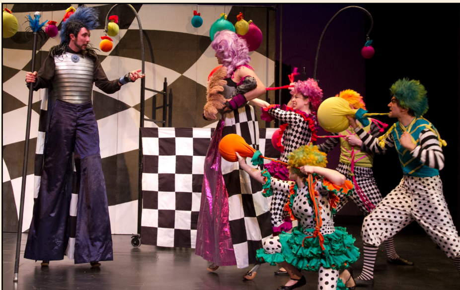
Oberon feuds with Titania and her Fairies in the 2014 touring production of A Midsummer Night's Dream .

For centuries, fairies were a source of fear and anxiety for many communities. These beings were believed to be forces of nature, fiendish creatures that were sometimes seen as little different than the demons of hell. Fairies were blamed for all kinds of mishaps, from a freak storm that destroyed the crops to a "spooked" horse that threw its rider. At best, their behavior towards humans was prankish, at its worst,