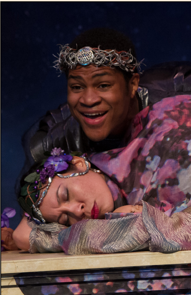
Oberon and Titania in the 2015 touring production of A Midsummer Night's Dream .