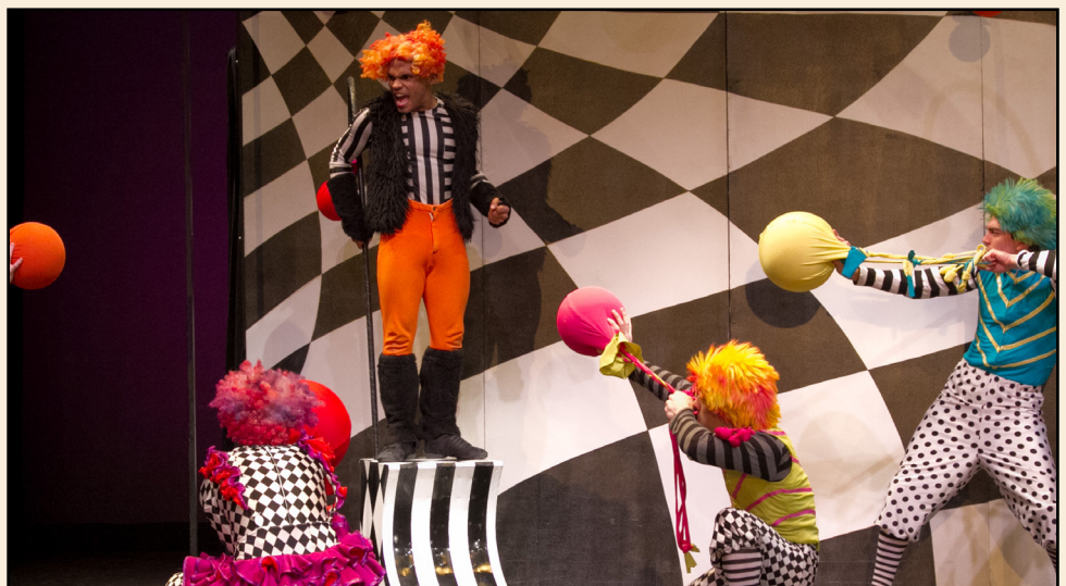
Puck and the Fairies from the 2014 touring production of A Midsummer Night's Dream .