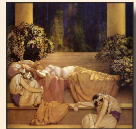
Daybreak (l) and Sleeping Beauty (r) by Maxfield Parrish