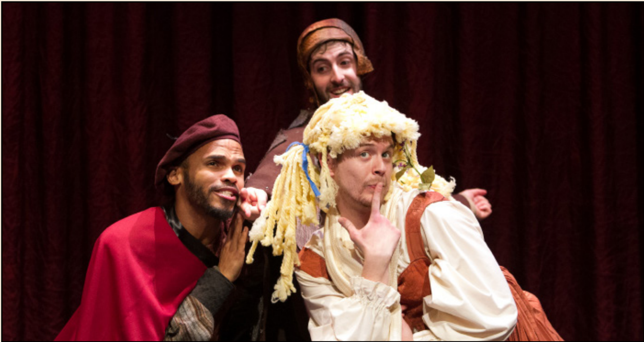
Snout (as the Wall), Flute (as Thisbe) and Bottom (as Pyramus) in the 2015 touring production of A Midsummer Night's Dream .