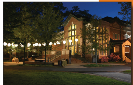
The Shakespeare Theatre of New Jersey's Main Stage