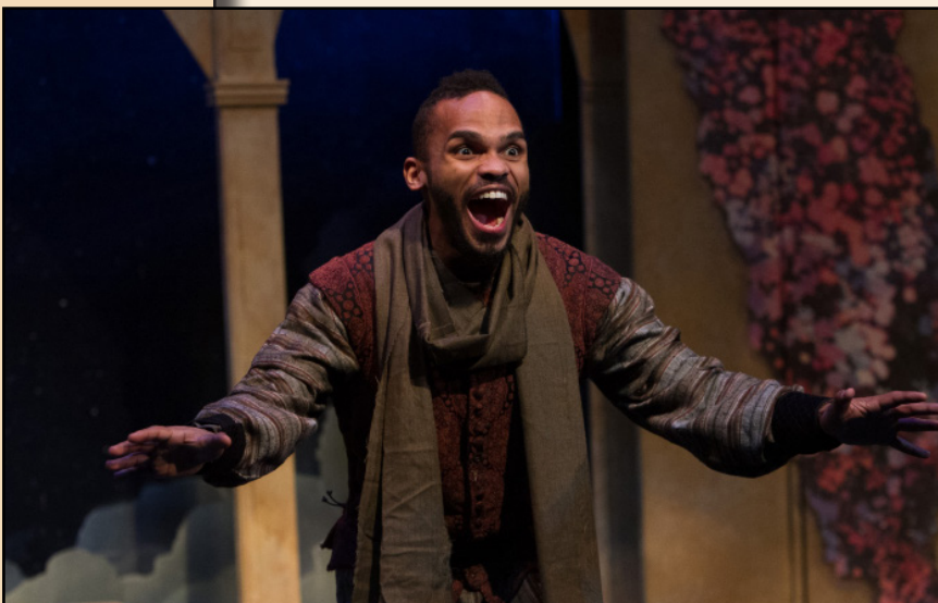
Bottom from the 2015 touring production of A Midsummer Night's Dream .

The names of the Mechanicals mostly reflect their occupations. Bottom, the weaver, is named for a skein of yarn or thread, called a "bottom." The name of Quince, the carpenter, suggests "quines," or blocks of wood used by carpenters in building. Flute is a bellows mender-- the bellows has a fluted shape, and was used to compress air to stoke a fire or to produce sound (as in a church organ). Snout, the tinker, would have been a mender of pots, pans and kettles-- the spout of a kettle was often called a "snout" in Shakespeare's time. Snug, is a joiner, one who manufactures cabinets and other jointed furniture made of snug-fitting pieces of wood. Finally, in Shakespeare's time, tailors were usually depicted as abjectly poor and thus, rail-thin from hunger— in other words, "starvelings."