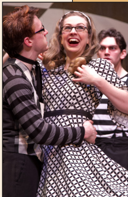
Demetrius and Lysander fight over Helena in the 2014 touring production of A Midsummer Night's Dream .

Isaac Asimov notes that "there is a folk belief that extreme heat is a cause of madness (hence the phrase 'midsummer madness') and this is not entirely a fable. The higher the sun and the longer it beats down, the more likely one is to get sunstroke, and mild attacks of sunstroke could be conducive to all sorts of hallucinatory experiences. Midsummer, then, is the time when people are most apt to imagine fantastic experiences."