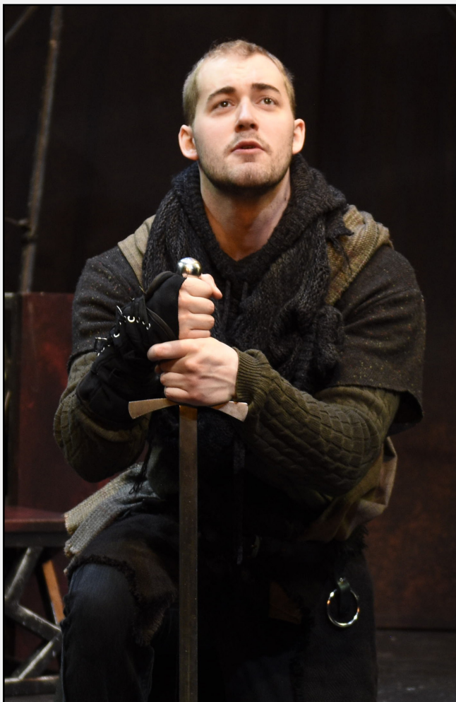
Macduff in the 2023 Shakespeare LIVE! touring production of MACBETH.

“It is certainly indicative that there are only two plays in which the word ‘love’ occurs so seldom as in Macbeth , and no play in which ‘fear’ occurs so often; indeed, it occurs twice or thrice as often as in most other plays”