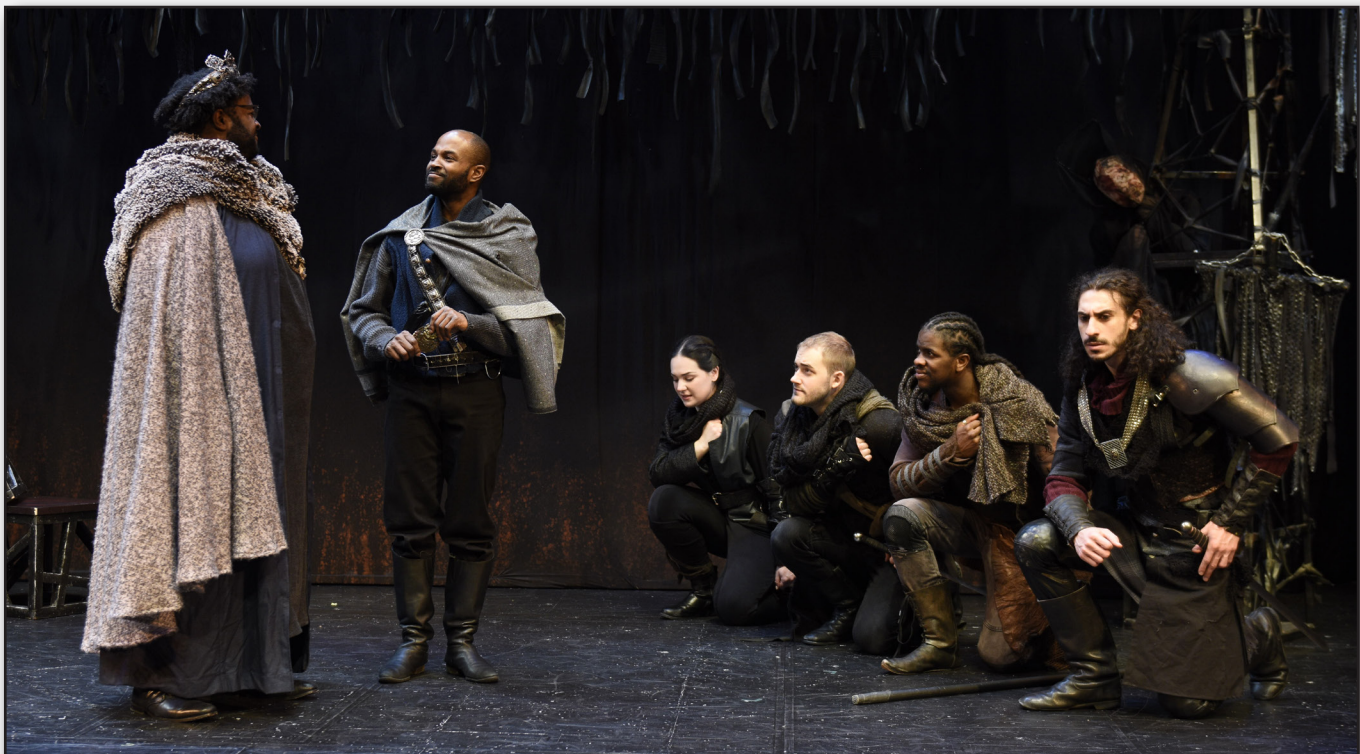
Malcolm is named Prince of Cumberland in the 2023 Shakespeare LIVE! touring production of MACBETH.

Another director who made his name in the world of film, Ingmar Bergman, directed a 1948 production whose principal scenic element was a huge tree in whose branches the witches cavorted and from which human corpses and cattle carcasses swung. The eerie, violent world of Macbeth seems to cast a particular spell over filmmakers. In 1957, Akira Kurosawa adapted the play in his film Throne of Blood , transporting the story to medieval Japan, with the principal characters depicted as Samurai warriors. Roman Polanski's 1971 film retained the medieval Scottish setting, but amped up the violence and sexuality of the play. Other film adaptations have included Men of Respect (1991), in which Macbeth is a Mafia hitman, Mike Battaglia (played by John Turturro), and Scotland, PA (2001) in which Macbeth is a disgruntled employee at a small-town diner, Duncan's Cafe, pursued by cop Lieutenant McDuff (played by Christopher Walken) after he murders his boss and takes ownership of the restaurant. Macbeth continues to be a staple of theatres around the world, and the roles of Macbeth and Lady Macbeth remain among the most prestigious and coveted for actors.