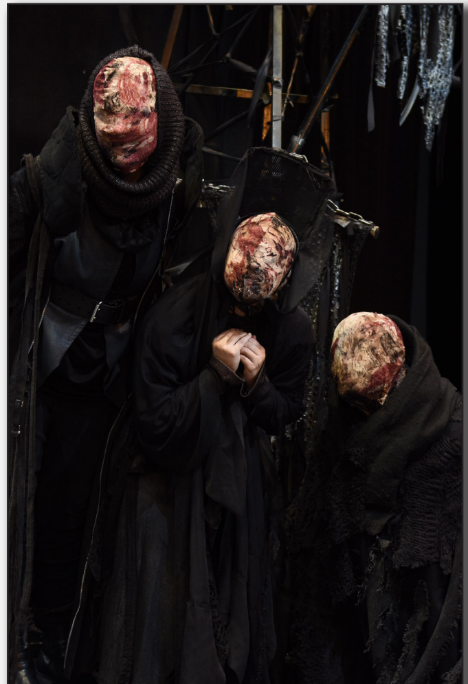
The Weird Sisters in the 2023 touring production of MACBETH.

On the eve of the great battle, Macbeth is told that Lady Macbeth has died. Alone, he ponders the meaning of his existence. A messenger brings him word that Birnam Wood has begun to move toward Dunsinane. Determined to beat the fate the witches said awaited him, he goes to battle. On the battlefield, he encounters Macduff. As Macbeth gloats that "none of woman born" can harm him, Macduff tells him that he was not born of woman, but rather had been delivered via caesarian-section. They fight and Macbeth is killed. Malcolm is crowned the new and rightful King of Scotland.