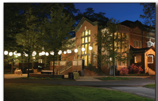
The Shakespeare Theatre of New Jersey's Main Stage