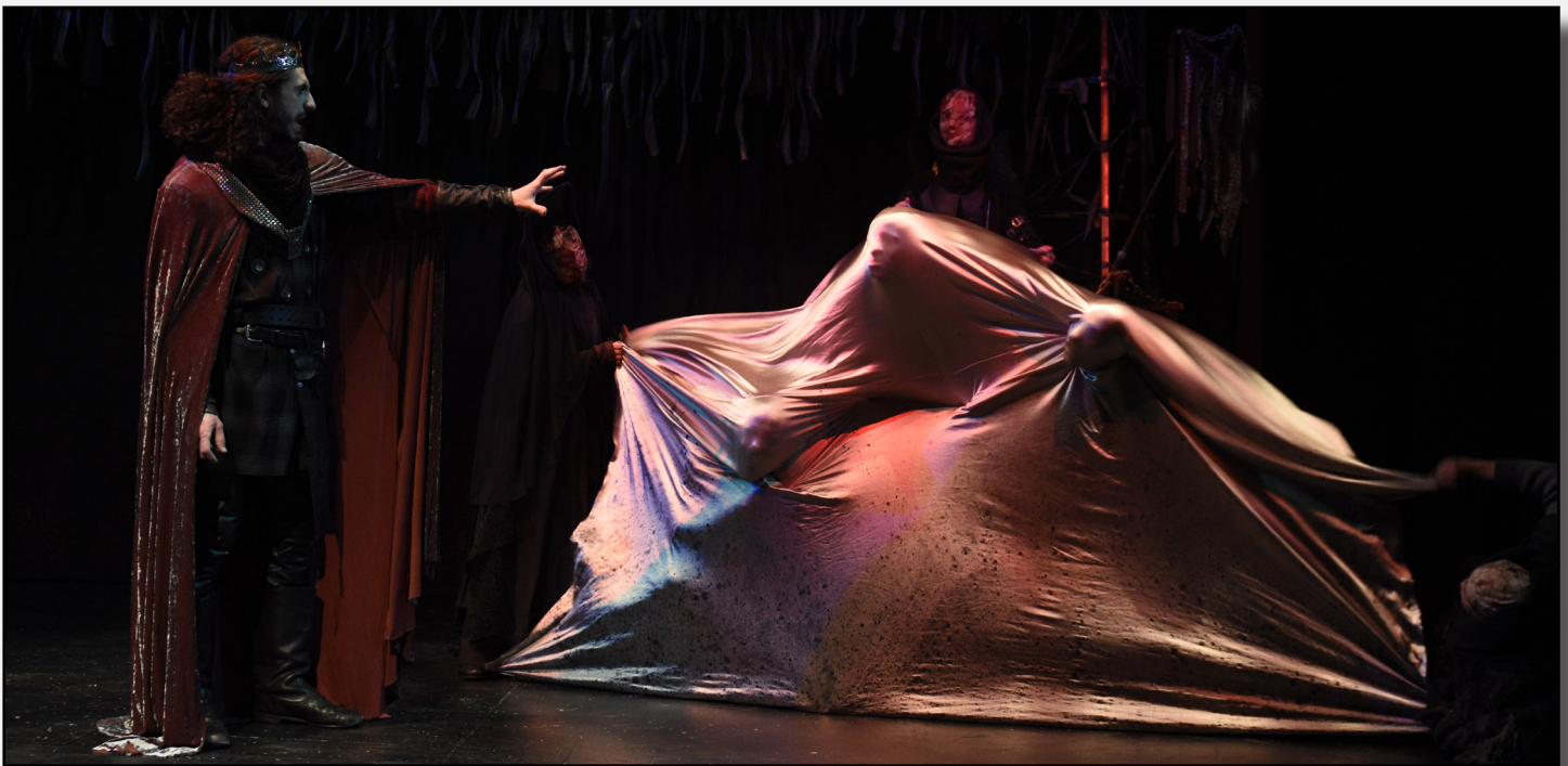
Macbeth visits the Weird Sisters and hears from three apparitions in the 2023 Shakespeare LIVE! touring production of MACBETH.