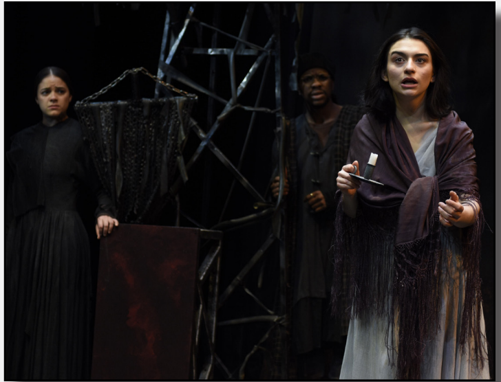
Lady Macbeth sleepwalks as the Gentlewoman and the Doctor watch in the 2023 Shakespeare LIVE! touring production of MACBETH.