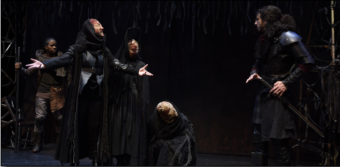
Macbeth and Banquo are visited by the Weird Sisters in the 2023 Shakespeare LIVE! touring production of MACBETH.