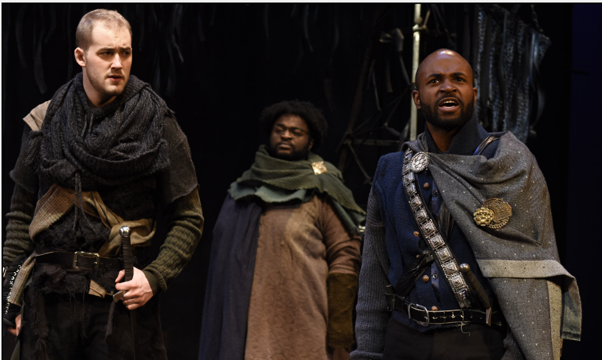
Malcolm (right) with Macduff and Siward plan their attack in the 2023 Shakespeare LIVE! touring production of MACBETH.