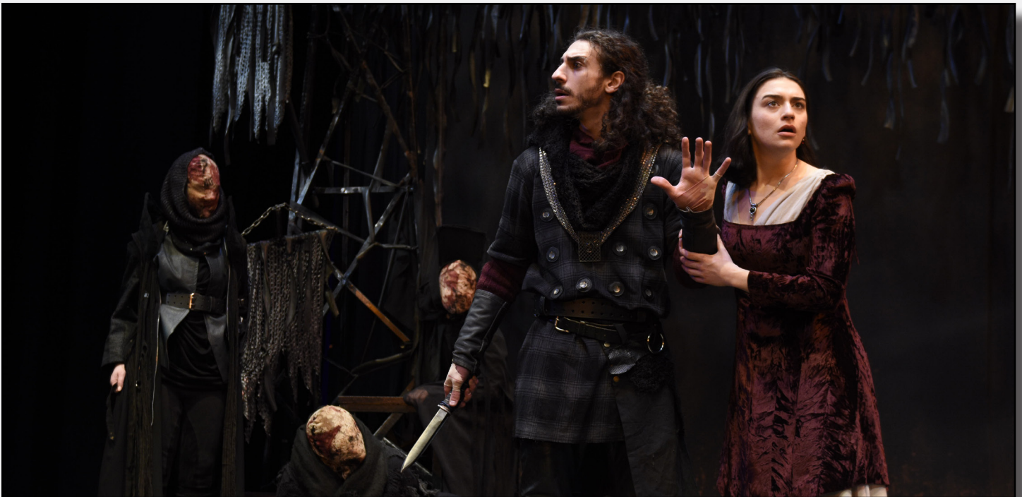
Macbeth and Lady Macbeth are observed by the Weird Sisters in the 2023 Shakespeare LIVE! touring production of MACBETH.